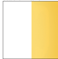
Gold and White - GWI